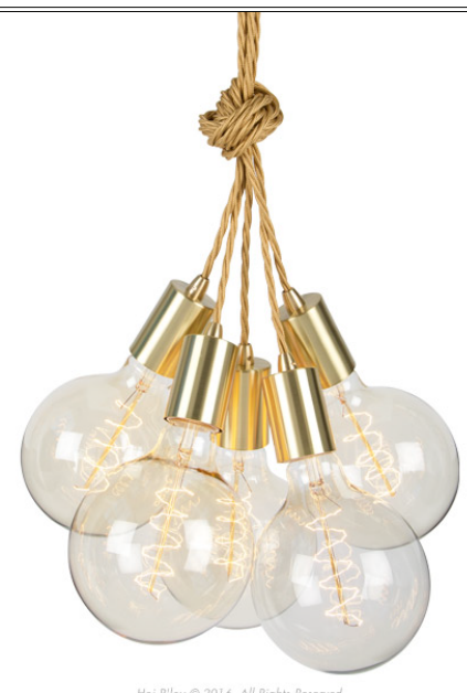
Hoi P'loy © 2016. All Rights Reserved.